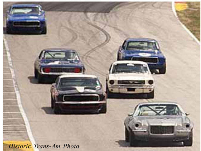
Historic Trans-Am Photo

The Historic Trans-Am group provided a win-win situation for both the spectators and the owner/drivers of these original O/2L 1966 to 1972 Trans-Am cars. Just as the original Trans-Am Series had done over 40 years ago.