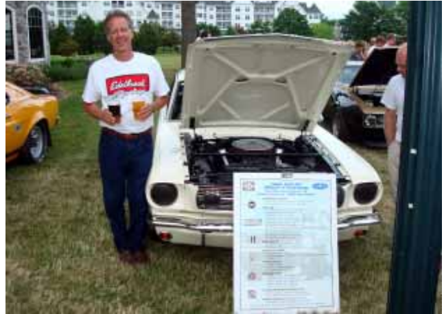
We were parked between the 1970 George Follmer Boss 302 and the 1968 Smokey Yunick Camaro on the grounds of the Osthoff Lake Resort.