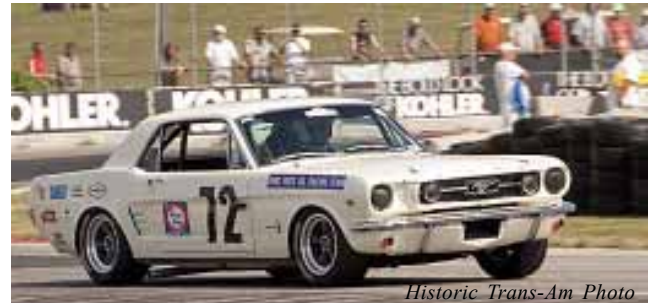
Historic Trans-Am Photo

The Historic Trans-Am group provided a win-win situation for both the spectators and the owner/drivers of these original O/2L 1966 to 1972 Trans-Am cars. Just as the original Trans-Am Series had done over 40 years ago.