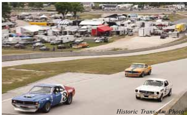
Historic Trans-Am Photo

Positions were continuously traded within the packs and it was not until the last lap that the field began to spread out to about 8 packs.