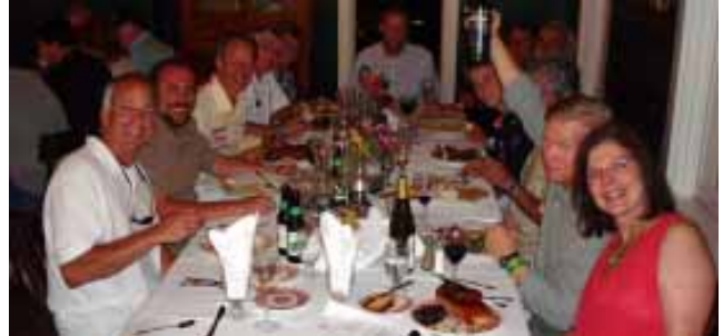
Saturday evenings Historic Trans-Am Group Dinner was held at Siebkens Resort in Elkhart Lake.