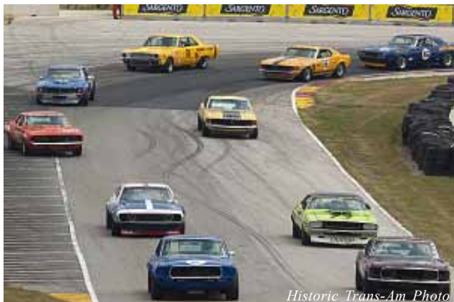
Historic Trans-Am Photo

Sundays race began with the temperature over 100 degrees. After lap one, the field broke down into 5 packs for much of the remainder of the race. The competition was close despite the length of Road America. The field consisted only briefly of cars running alone once the pace of the packs was established.