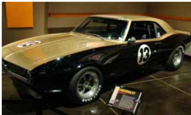
The 1968 Smokey Yunick Camaro, currently in the Vic Edelbrock collection and raced in vintage events.